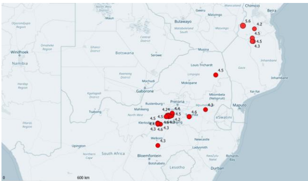
Figure 103. 20 earthquakes > M4.3 rocked South Africa in 2018. One of the documented EPAs is mentioned here. EPA alerts can remarkably extend the earthquake insurance penetration rate, and of course, when EPAs followed by an earthquake, insurance loss drastically increases.

While major earthquakes are uncommon in South Africa in general, the earthquake occurred in a mining belt where earthquakes are relatively common. The CGS had described a 2005 earthquake with a magnitude of 5.3 on the Richter scale in the same area as Orkney as the largest mining-related earthquake in South Africa. The earthquake occurred on 9 March 2005 at DRDGOLD's Hartebeesfontein mine in Stilfontein, killing miners underground and resulting in the closure of the mine. An investigation by the mining regulator following the incident found that it was caused by mining and further seismic events would occur while mining continued. The report on the investigation recommended improvements in seismic monitoring among other things, and some of the recommendations had been implemented before the 2014 earthquake. The USGS recorded a 4.9 moment magnitude earthquake on 15 June 2014 in the same area, which earth sciences believe may have been a foreshock.